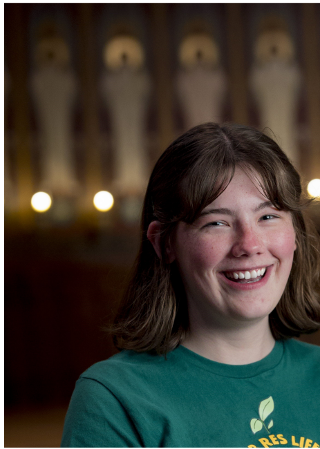
Upper class Residence Halls Director