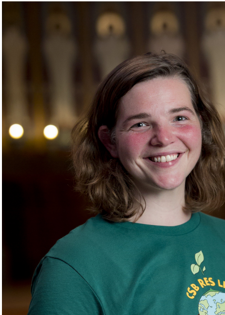
Campus Apartments Residence Director